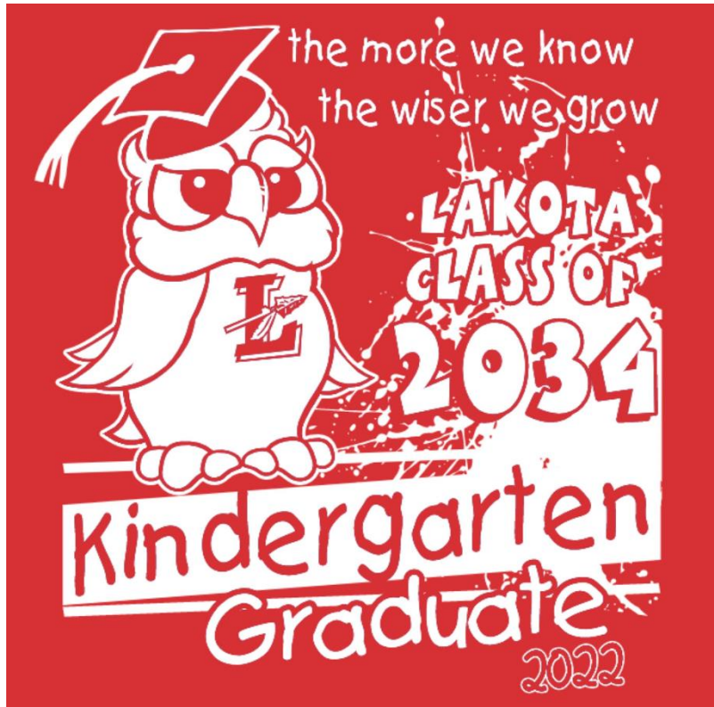
Front of Shirt