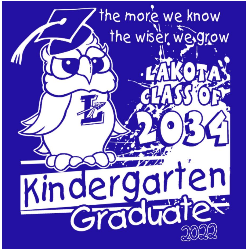
Front of Shirt