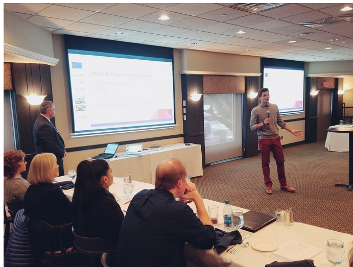
CEO Internship Program Student sharing his experience with the BAC members.