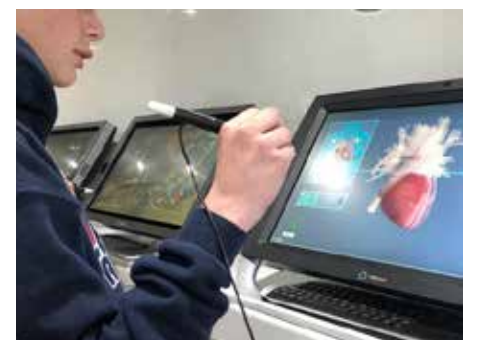
Carson using a virtual scope to travel through the heart.