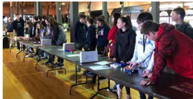
Mars Rover Challenge Teams