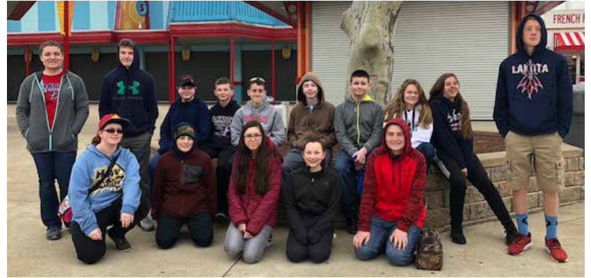
LMS Students attend Success Bound Innovation Faire