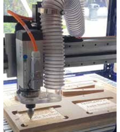
Carving with the CNC Mill