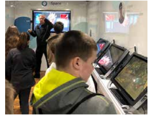
zSpace Learning Lab