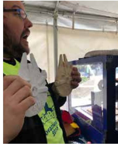
Fab Lab - Additive vs. Subtractive (3D printing vs. CNC Milling)