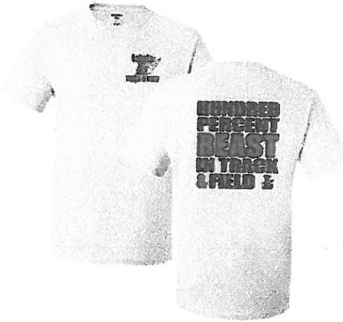
(Color option for all other apparel of white or sport grey)