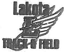
Left Chest Design