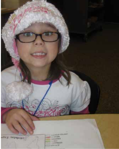
All smiles for 1st graders working on holiday projects.