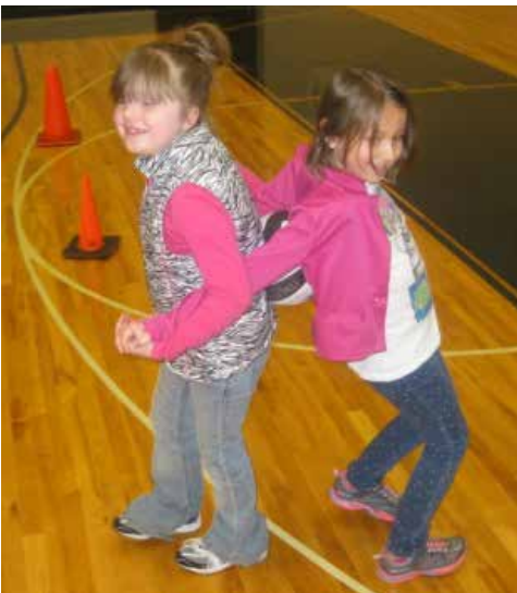
Accelerated Reader party fun!