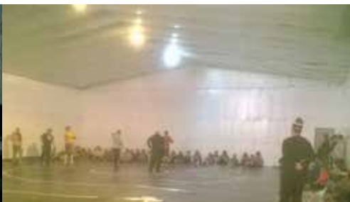
Thanks to Dave and Lucy Ritter who were kind enough to open up their barn to allow us to safely practice and allow each athlete a chance to improve themselves.