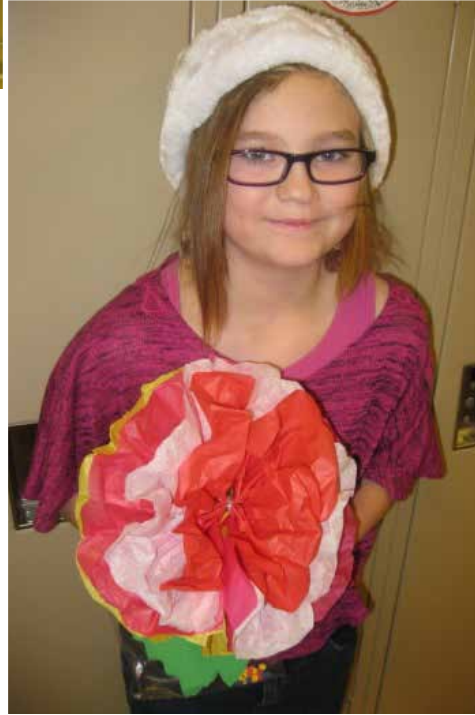
3rd Grade artwork and gifts!