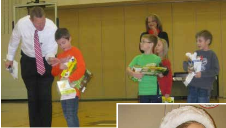
PTO's assembly for the top sellers