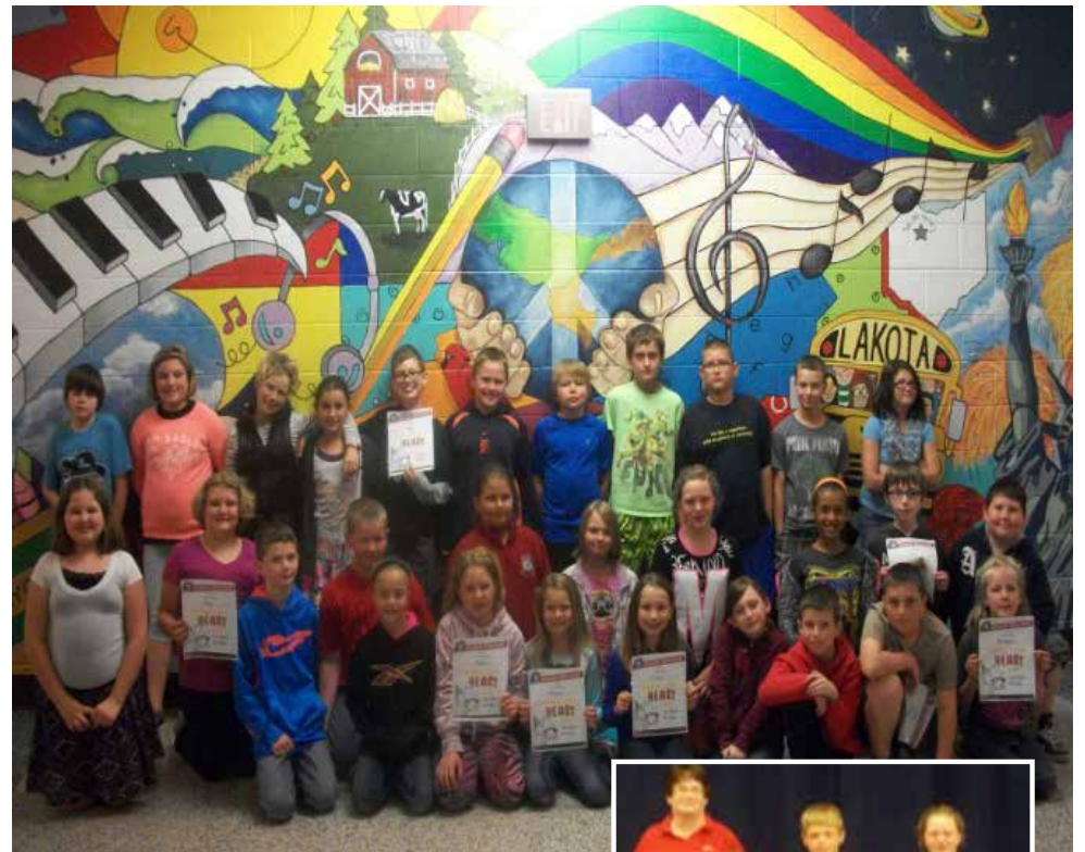
4 th Grade Book It Participants

These 4 th graders completed the Pizza Hut Book It Reading program. Students read to meet monthly goals from October through March. Students were rewarded for their hard work with a certificate and a sundae party.