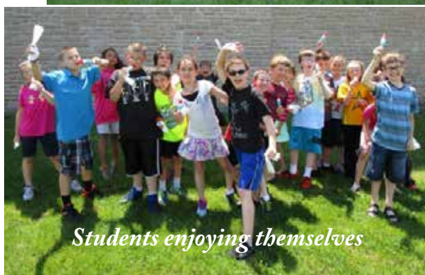
Students enjoying themselves