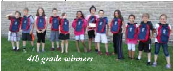
4th grade winners